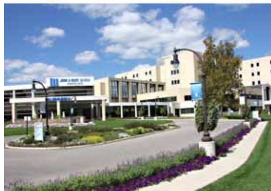
LMH has received an A rating by The Leapfrog Group for its excellent record of patient safety.

A national organization that advocates for employer health plans has given Licking Memorial Hospital (LMH) its highest rating for patient safety. The Leapfrog Group reviewed data reports from more than 2,600 U.S. hospitals to evaluate specific patient safety issues, and then applied a score of A, B, C, D or F to inform the public of their local hospitals' performances. LMH received an A rating.