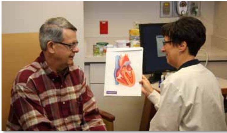
Patients receive personalized education and monitoring in the Heart Failure Clinic to help them manage their chronic condition.

Patients who are diagnosed with heart failure sometimes feel overwhelmed by the diagnosis and lifestyle changes that their physicians recommend. Licking Memorial Hospital (LMH) offers an outpatient Heart Failure Clinic that provides education, assessment, monitoring, and advice to help heart failure patients make the lifestyle changes necessary to lead longer and healthier lives.