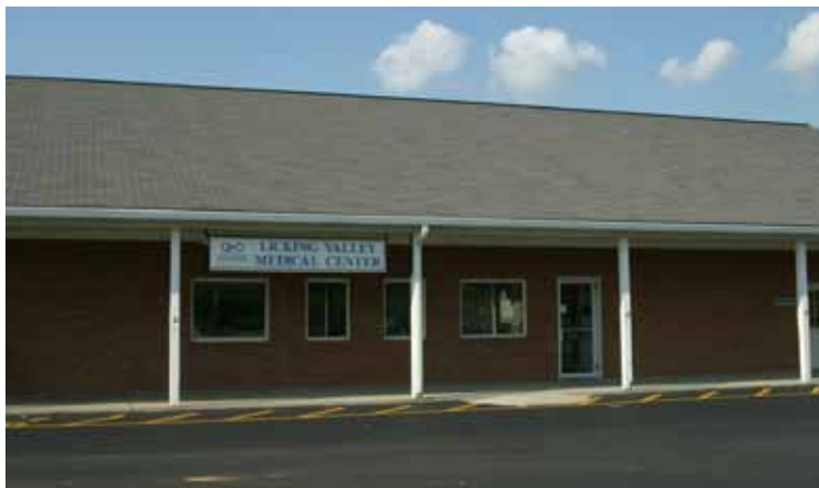
Licking Valley Medical Center is located at 2181 W. High Street, N.E., in Hanover.