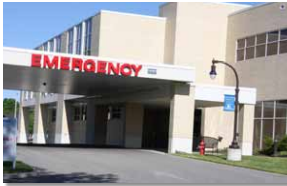
Anyone who experiences stroke symptoms is urged to seek immediate medical help to improve their chances of recovery.