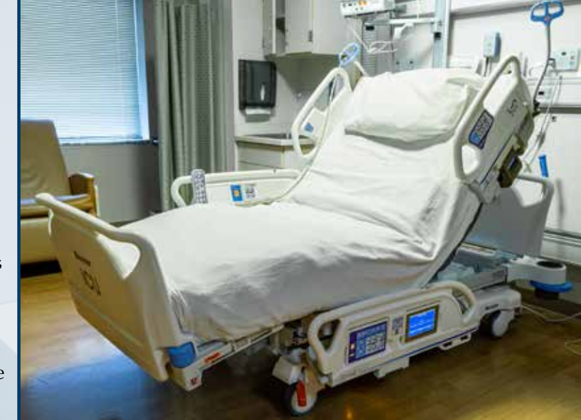
Progressa+ True ICU Smart Bed

The rapid diagnostic test allows Emergency Department staff to quickly triage patients with traumatic brain injuries and make a more informed decision about the safety of discharging the patient without performing a CT scan. According to Abbott, the TBI test can potentially reduce unnecessary CT scans by up to 40 percent. The quick turnaround time can decrease patient wait time in the ED, clear resources for other patients, and reduce the cost of treatment. LMH is the third hospital in the entire nation to adopt the i-STAT Alinity TBI Plasma Test.