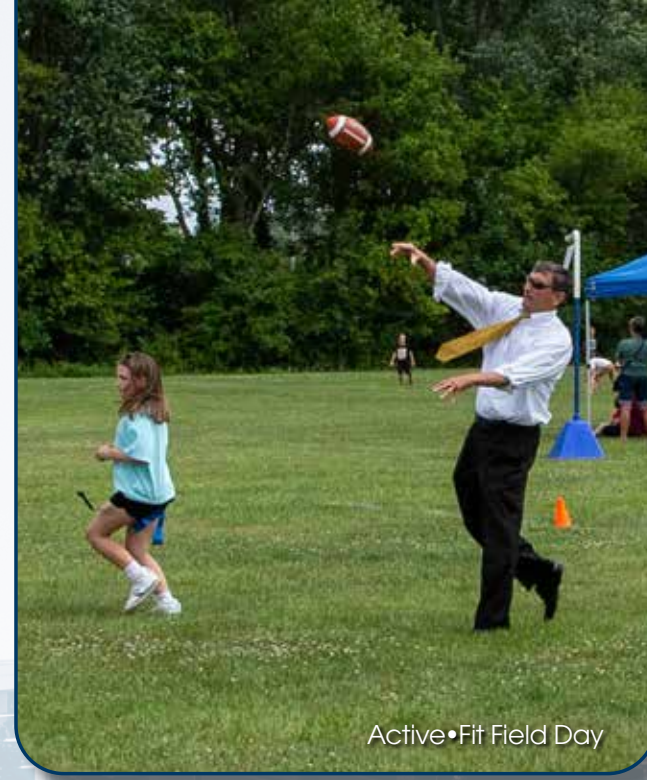
Active•Fit Field Day