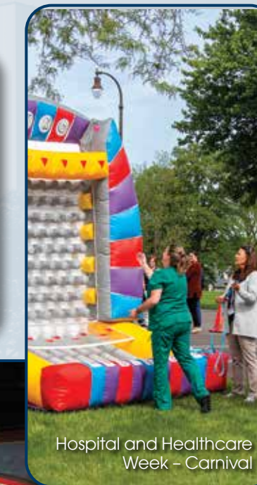
Hospital and Healthcare Week – Carnival