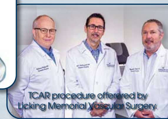
TCAR procedure offered by Licking Memorial Vascular Surgery