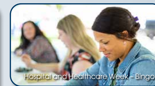
Hospital and Healthcare Week – Bingo