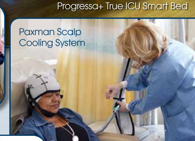
Paxman Scalp Cooling System