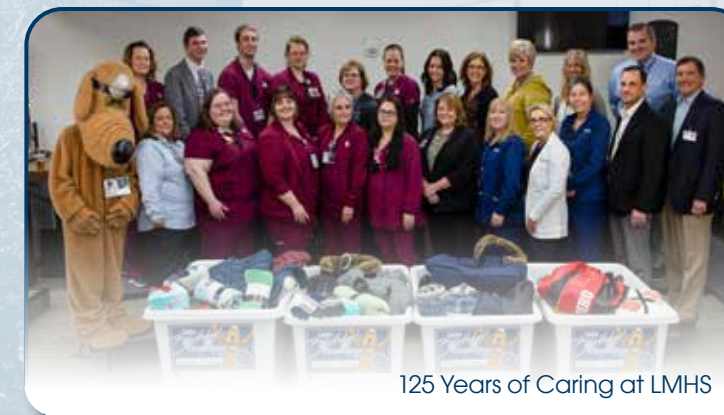
125 Years of Caring at LMHS