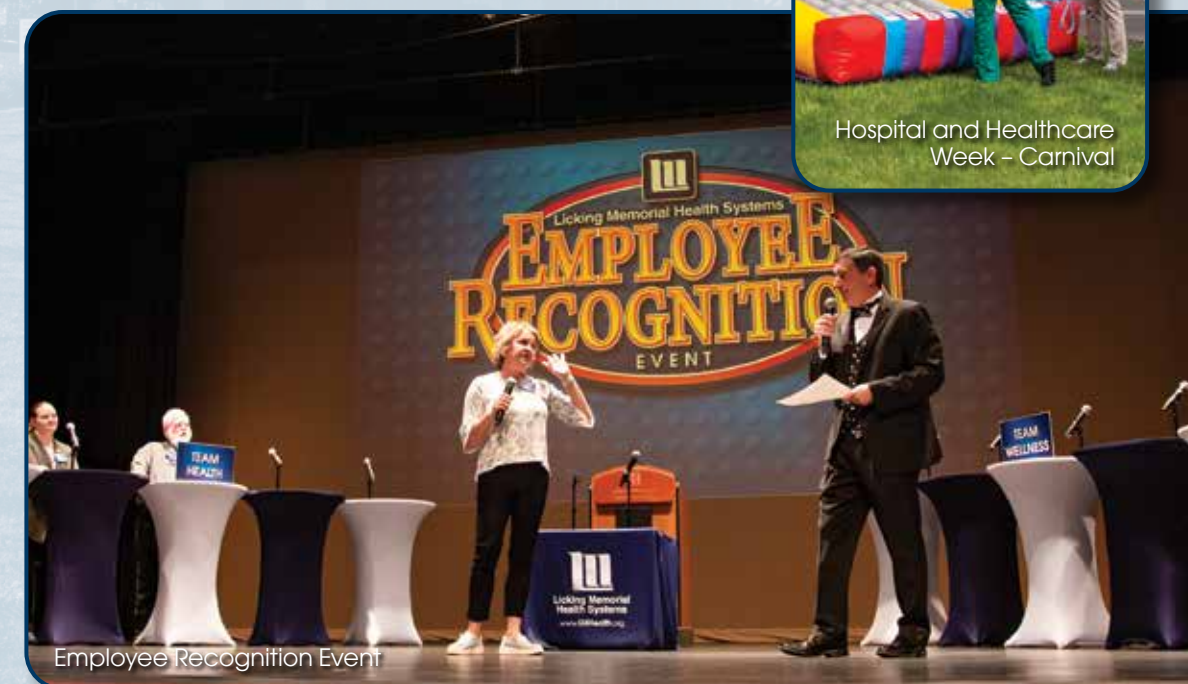
Employee Recognition Event