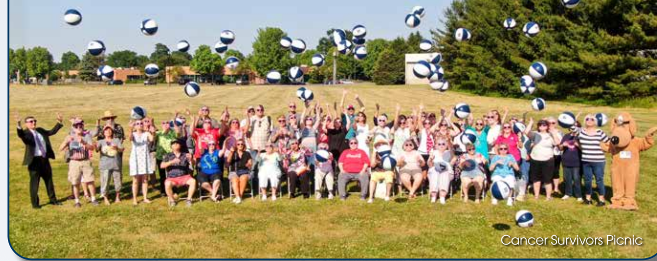
Cancer Survivors Picnic