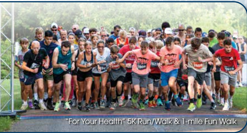
"For Your Health" 5K Run/Walk & 1-mile Fun Walk