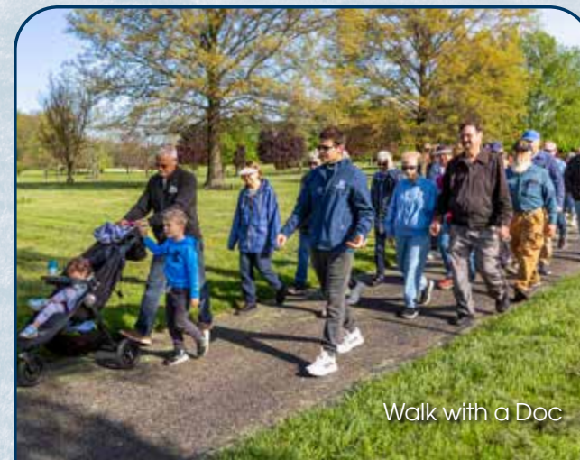
Walk with a Doc

LMHS Active Medical Staff physicians were joined by community members as they enjoyed a walk at various locations in Licking County, including The Dawes Arboretum and the Buckeye Lake Bike Path. During the walk events, the physicians led discussions on various topics, such as post-traumatic stress disorder (PTSD), skin cancer, and vaccinations.