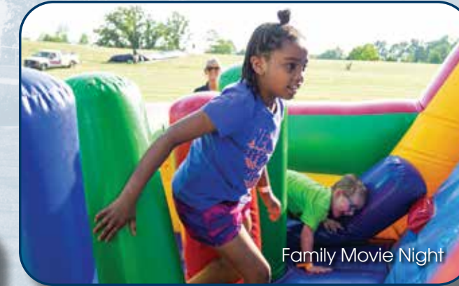
Family Movie Night