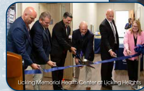
Licking Memorial Health Center at Licking Heights