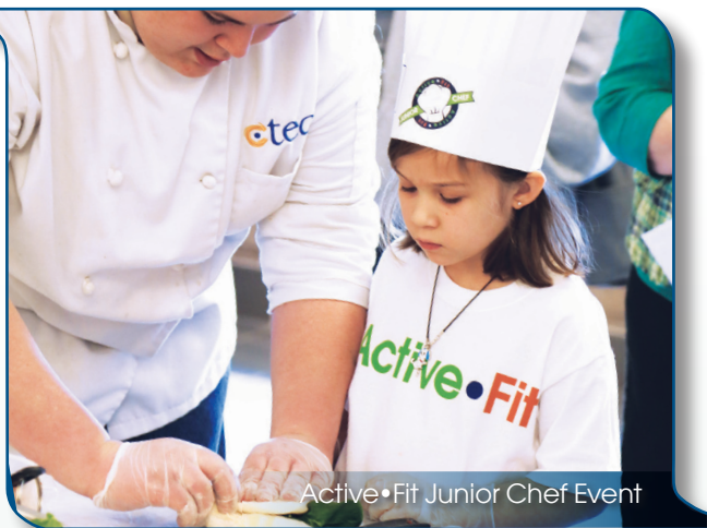
Active•Fit Junior Chef Event