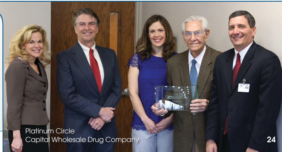
Platinum Circle Capital Wholesale Drug Company

Honorary and Memorial Giving Program – Many community members appreciate the opportunity to pay tribute to a loved one, commemorate a special event or celebrate a recovery through monetary contributions that benefit LMH. In 2014, LMHF received two honorary and 53 memorial donations. In addition, 34 contributors made Doctors’ Day donations to honor their physicians.