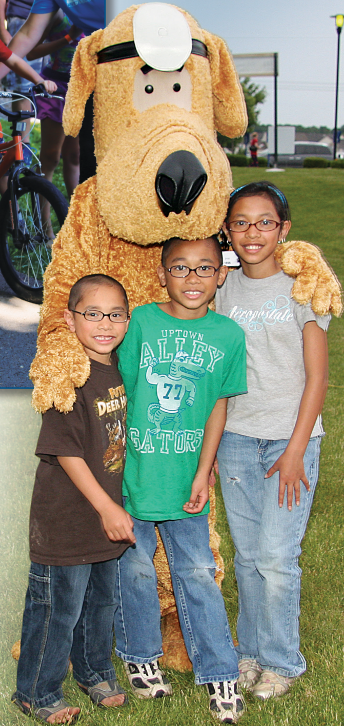
Active•Fit Youth Wellness Event

LMHS receives a great deal of appreciative feedback regarding the programs for infants, children and youth. By dedicating resources to improve the health and well-being of the community's residents at an early age, LMHS is laying the groundwork for the next generation to enjoy healthier, longer lives.