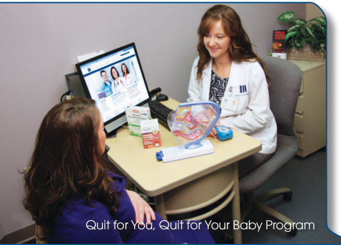
Quit for You, Quit for Your Baby Program

Licking Memorial Health Systems (LMHS) is dedicated to keeping abreast of medical advances and improving the healthcare experience for patients and their families. In many instances, the changes are subtle and take place without the public's awareness. Changes and improvements at LMHS over the past year include: