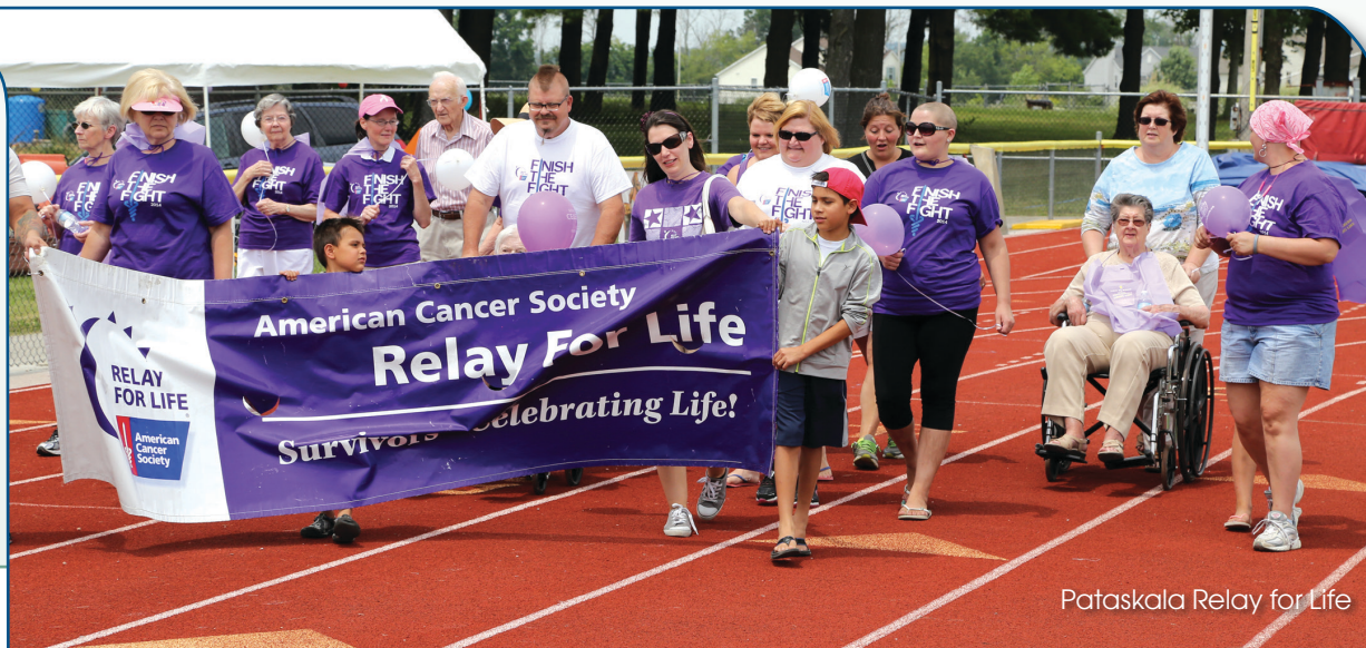
Pataskala Relay for Life