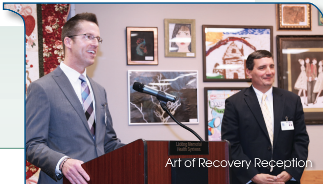
Art of Recovery Reception