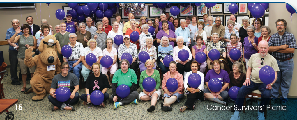
Cancer Survivors' Picnic

Cancer Survivors' Picnic – In recognition of National Cancer Survivors' Day, LMH hosted its fourth-annual Cancer Survivors' Picnic on June 8. LMH patients, guests and employees gathered in the Hospital Café to celebrate and support cancer survivors, and to honor lost loved ones.