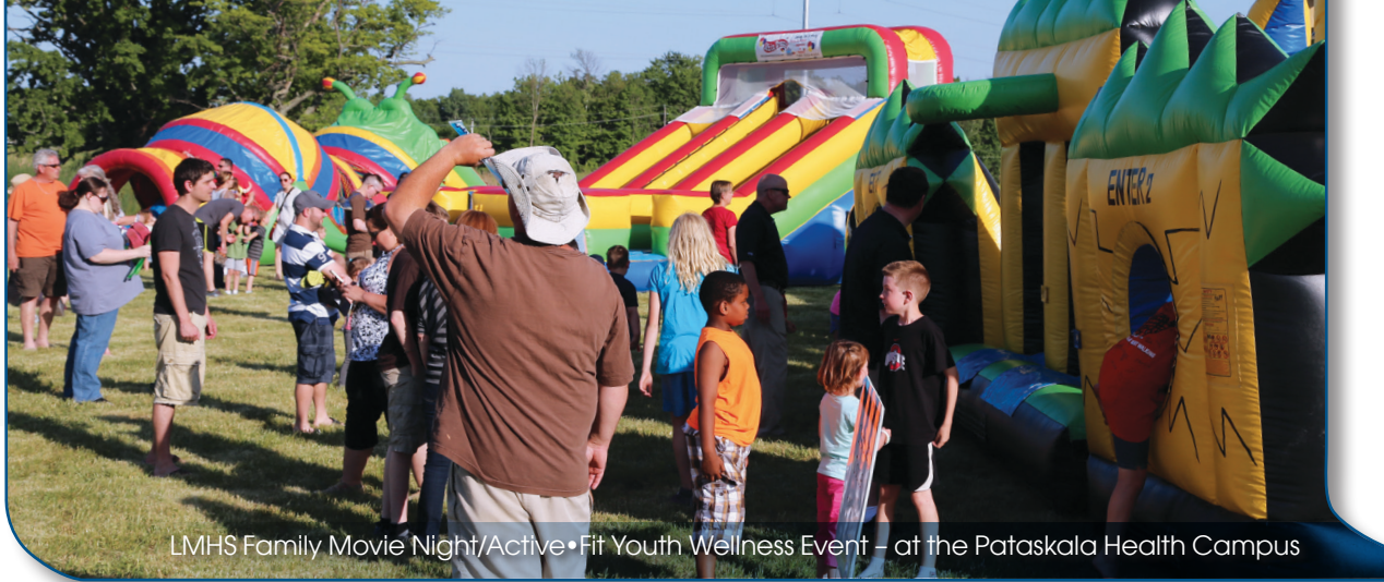
LMHS Family Movie Night/Active•Fit Youth Wellness Event – at the Pataskala Health Campus