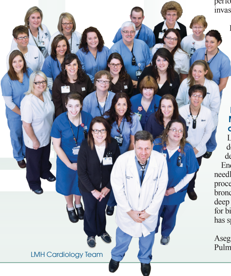
LMH Cardiology Team

MUSE offers connectivity with cardiology diagnostic tools including EKG tests, stress tests, and Holter monitor devices. The diagnostic results from these devices are all integrated in the MUSE System, allowing for better patient triage, access to current and historical EKG results for comparison, and automating patient demographics. MUSE is a complete electronic repository of cardiac information – including everything from billing to delivering results. The System, which went live in April 2014, allows for tracking information and makes comparisons from previous EKG tests on a patient easier and more accessible, ultimately enhancing quality for patients.