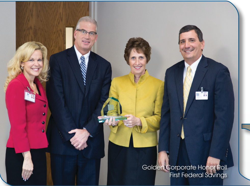
Golden Corporate Honor Roll First Federal Savings

Licking Memorial Health Systems (LMHS) relies, in part, on charitable donations to proactively incorporate technological advances and meet growing community needs. The Development Department at Licking Memorial Hospital (LMH) works diligently to ensure that the Hospital has the funds available for continuous improvements. Contributions to LMHS are used to purchase equipment and to fund programs, capital expenses, and facility improvements. The contributions are not used for salaries or general operating expenses.