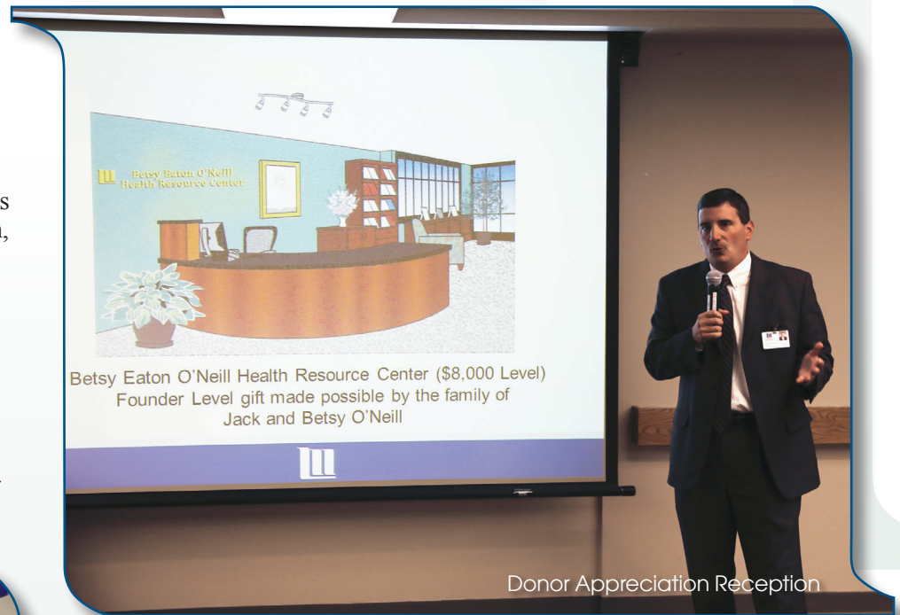
Donor Appreciation Reception

Donor Appreciation Reception – LMHS thanked contributors during the annual Donor Appreciation Reception in September. The event is an opportunity for donors to be recognized for their generous gifts and receive information on current and future projects at LMHS. At the 2014 reception, the latest piece in the LMHS Main Street Collection, a replica of the Betsy Eaton O'Neill Health Resource Center, was unveiled for donors who have reached the $8,000 level of giving. All donations are used to purchase new medical equipment and technology, and enhance the healthcare facilities at LMH.