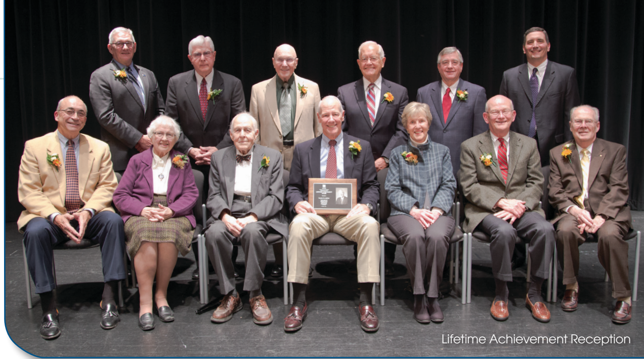
Lifetime Achievement Reception