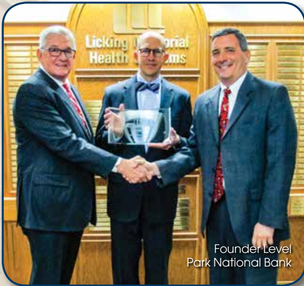
Founder Level Park National Bank

raised funds to benefit the new Licking Memorial Urgent Care and Family Practice facility. Conveniently located in Downtown Newark to provide services for all residents of Licking County, the facility features 12 exam rooms, four treatment rooms, and X-ray and Laboratory services.