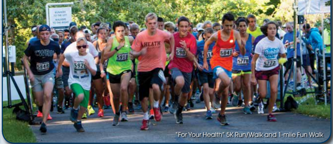
“For Your Health” 5K Run/Walk and 1-mile Fun Walk