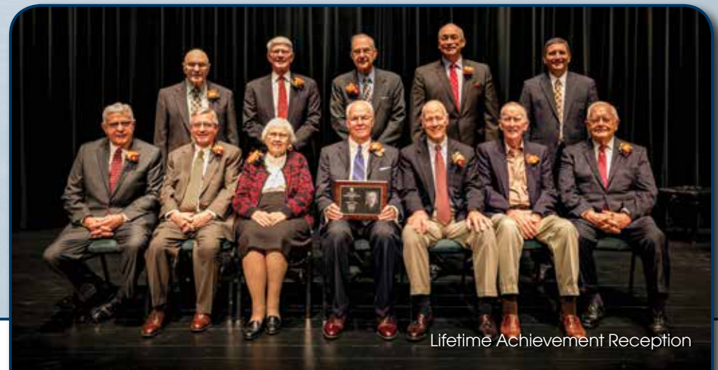
Lifetime Achievement Reception