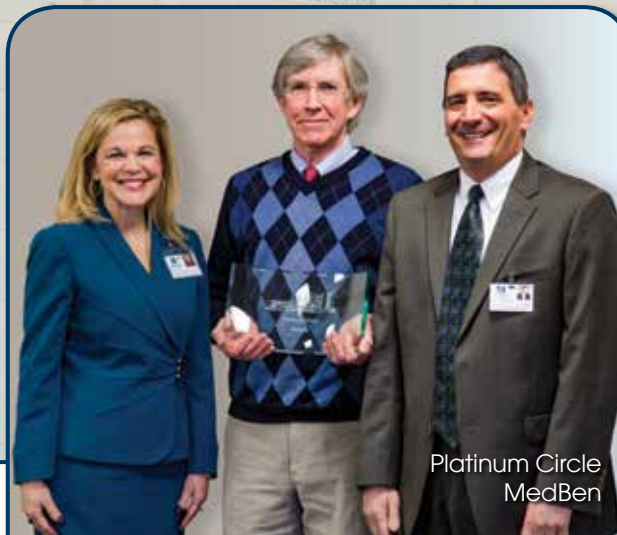
Platinum Circle MedBen