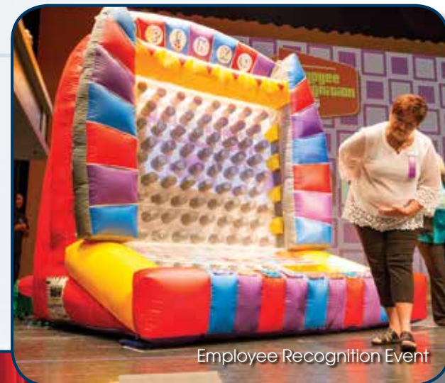
Employee Recognition Event

Employee Recognition Event – LMHS employees who observed anniversaries in 5-year increments in 2017 were invited to The Ohio State University – Newark Reese Center for the annual LMHS Employee Recognition Event, which featured a game show theme and offered honorees an opportunity to win prizes. The 290 honored employees – the most ever in one year – represented 3,320 combined years of service.