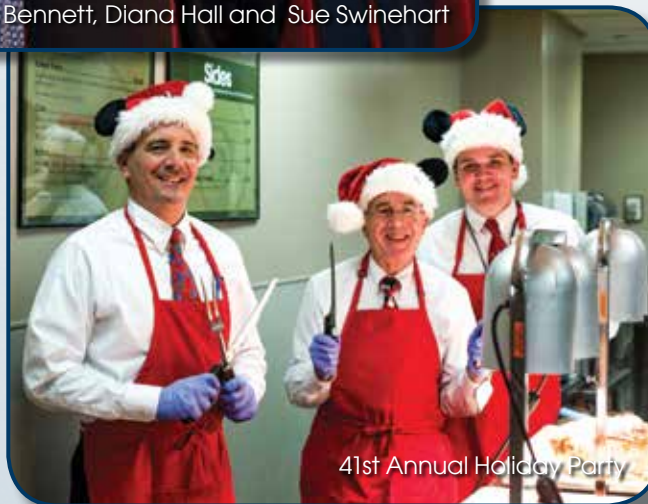
41st Annual Holiday Party

Retiree Dinner and Luncheons – In 2017, retired LMHS employees were invited to two Retiree Luncheons held at the DoubleTree by Hilton Hotel in April and September. In addition,