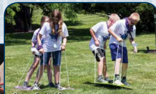
Camp Feelin' Fine

LMHS staff devoted their time in the summer of 2017 to educate local youth, ages 7 through 12, about various health topics in a fun, outdoor day camp setting. In June, Camp Feelin' Fine allowed kids to spend a day learning the best way to care for their asthma and interact with others who have the same condition. Camp Courage, held in July, aimed to help reduce stress and anxiety in youth who have encountered cancer through family or friends. Also in July, LMHS hosted Camp AIC – a day camp for youth with diabetes to learn about the health condition, how to manage it, and provide an opportunity to interact with other youth with diabetes. Camp Med was held in July, and featured an opportunity for high school seniors to learn about careers in health care.