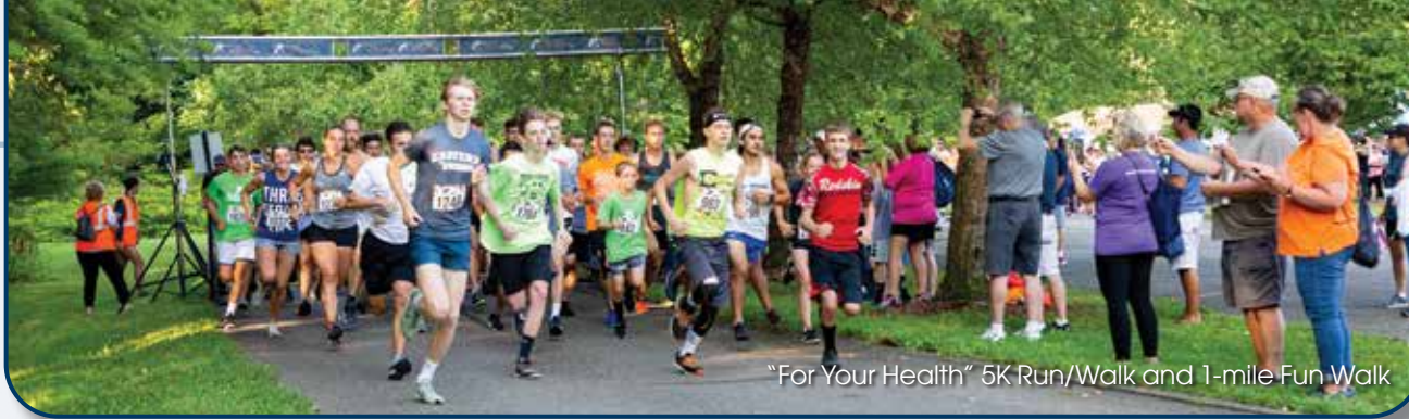
"For Your Health" 5K Run/Walk and 1-mile Fun Walk