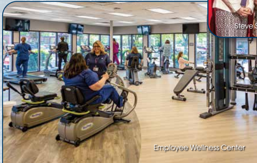
Employee Wellness Center