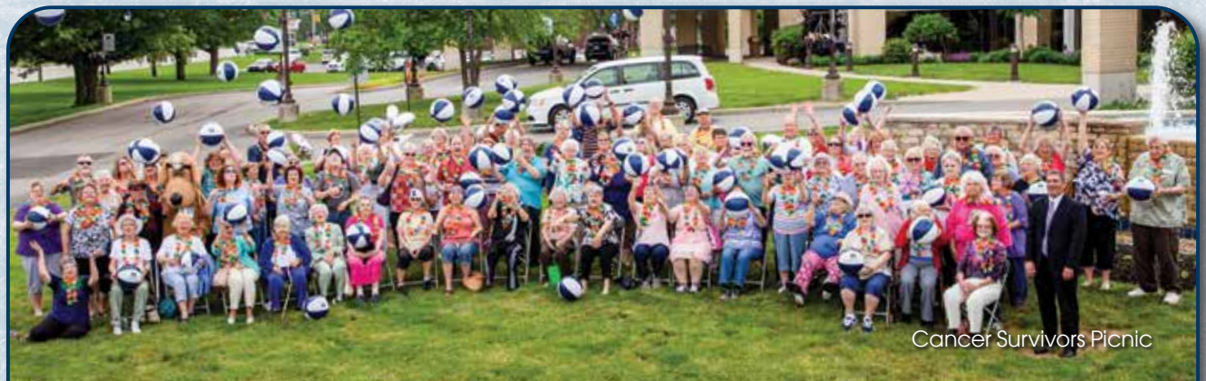
Cancer Survivors Picnic

LMHS staff devoted their time over the summer to educate local youth about various health topics in fun, outdoor day camp settings. On June 7, Camp Feelin' Fine hosted 30 children to learn more about asthma, manage their symptoms, and interact with others who also have the condition. On July 19, LMHS hosted Camp A1C, which is for children, ages 7 to 13, who have diabetes. Camp Med, which consisted of two days of interactive opportunities for high school seniors to learn about careers in healthcare, also was held in July. Camp Courage, held on August 2, was designed to help reduce anxiety about cancer for children, ages 7 to 13, who have had an encounter with the disease – whether personally or through a close friend or family member.