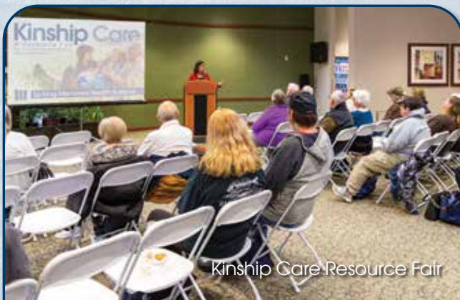
Kinship Care Resource Fair

The LMH Development Council hosted three new resource fairs in 2019. In August, Caring for Aging Parents welcomed approximately 350 guests to gather information about care facilities and healthy living. Approximately 100 guests, including new parents, expectant mothers, fathers-to-be and grandparents, attended Preparing for Baby on September 19. Information booths, which filled the LMH First Floor Conference Rooms, included materials on nutrition, car seat safety, infant, child and family CPR, safe sleep, Kangaroo Care and breastfeeding. Kinship Care, which offered numerous community resources for grandparents raising grandchildren, was held in November and welcomed approximately 150 guests.