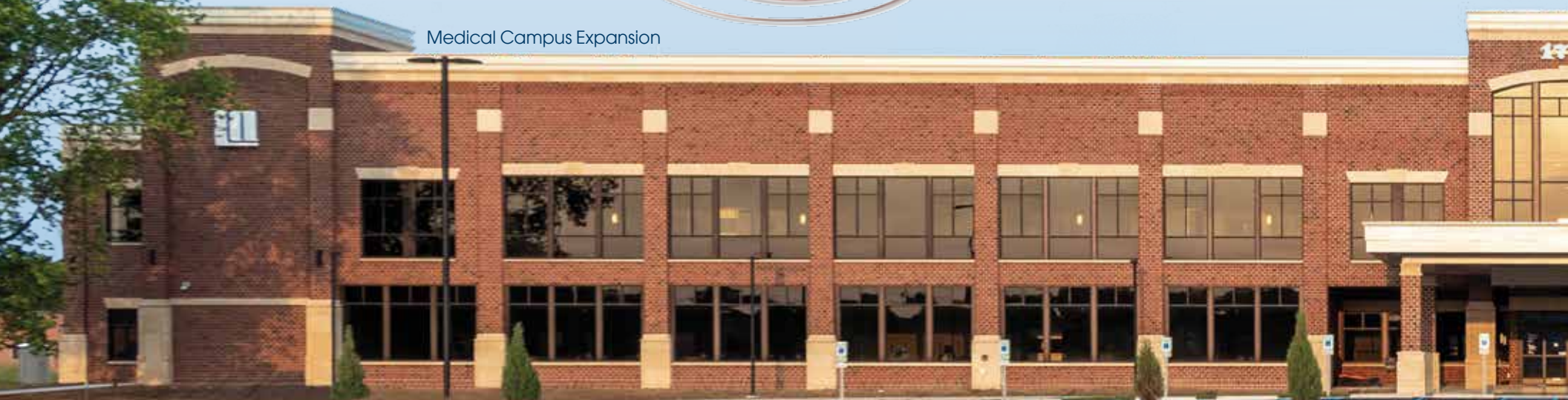
Medical Campus Expansion

LMH implemented the Enhanced Recovery After Surgery (ERAS) program, which combines simple evidence-based interventions aimed at improving post-operative recovery for patients undergoing major surgery. The ERAS program focuses on education, nutritional management, lifestyle changes to decrease smoking and alcohol intake, and utilizing alternate pain management strategies to minimize opioid use. ERAS utilizes recommended protocols for surgical procedures to create optimal outcomes for patients. These protocols are enacted when the surgeon or physician determines the need for surgery. The physician provides the patient with crucial pre-operative instructions that include the importance of tobacco and alcohol cessation, exercise, and consuming nutritious foods that will help boost the immune system. Additional protocols are completed during a preadmission testing clinic visit before the surgery date. These protocols help determine the best plan for the patient.