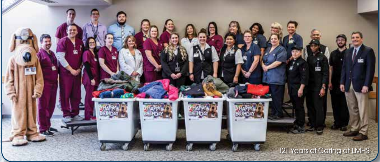
121 Years of Caring at LMHS