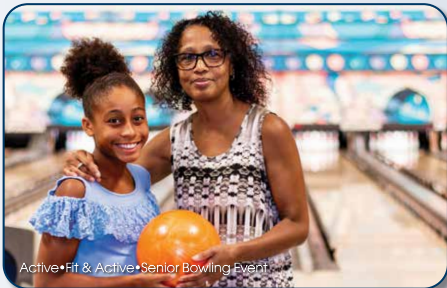
Active • Fit & Active • Senior Bowling Event

the United Way, Habitat for Humanity, Big Brothers Big Sisters and The Salvation Army. Many employees also offer their expertise as speakers at area events.