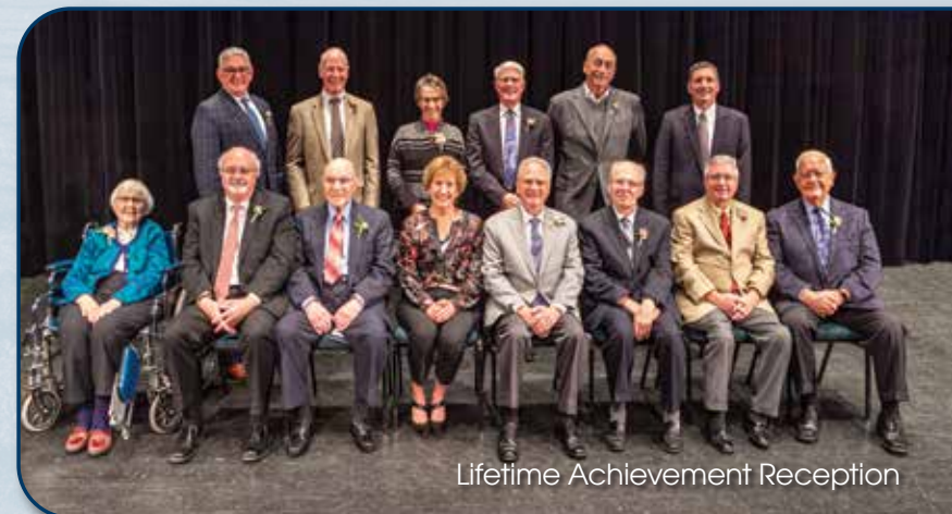
Lifetime Achievement Reception