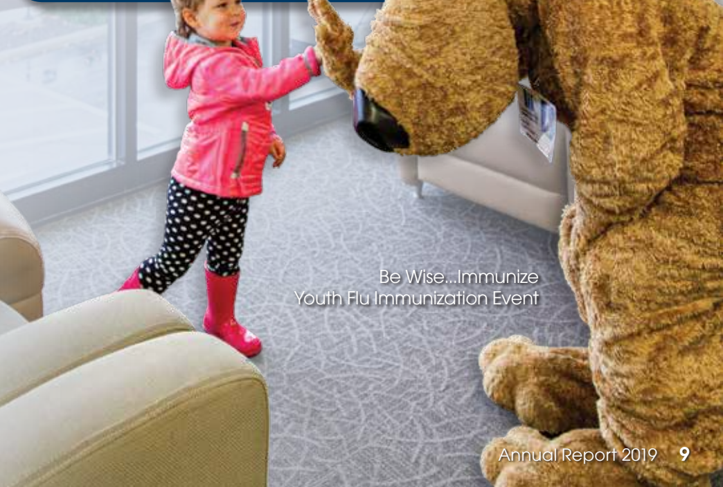
Be Wise...Immunize Youth Flu Immunization Event