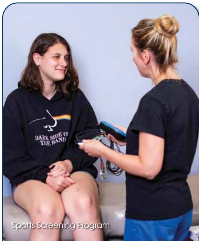
Sports Screening Program

Improving the health of the community means offering resources and opportunities for residents to take control of their lifestyle and healthcare choices. LMHS provides as many activities and programs as possible and also supports other organizations that do the same. LMHS and its employees donate time and resources to