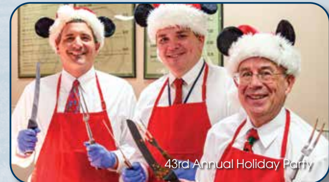
43rd Annual Holiday Party

For a sixth year, LMHS was named to Modern Healthcare's Best Places to Work in Healthcare, a listing of the nation's top 100 healthcare-related employers. The recognition honors workplaces throughout the healthcare industry that empower employees to provide patients and customers with the best possible care, products and services.